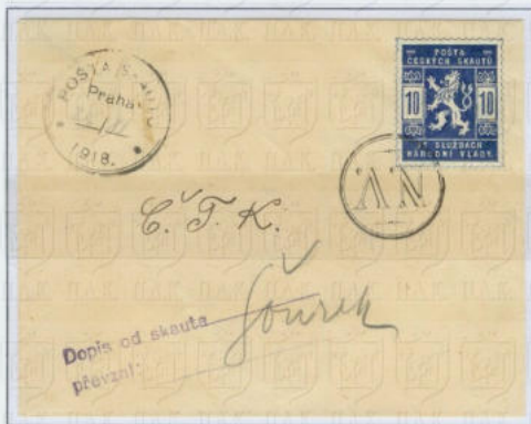
Cover with a 10H Scout stamp tied with N.V. Scout handstamp and delivered (Nov. 23, 1918) to the newly founded Czechoslovak News Agency (C.T.K.) by Scout Sourak. The Scout ods and delivery handstamps are shown too