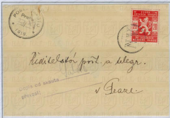
Cover with a 20H Scout stamp tied with N.V. Scout handstamp and delivered (Nov. 23, 1918) to the Praze district by Scout Salka. The Scout cds and delivery handstamps are shown too