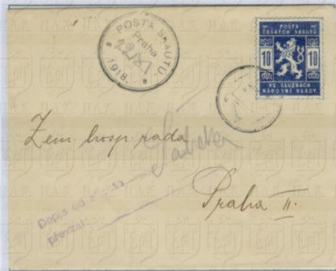
Cover with a 10H Scout stamp tied with N.V. Scout handstamp and delivered (Nov. 22, 1918) to the Praha II district by Scout Salda. The Scout cds and delivery handstamps are shown too