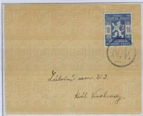
Cover with a 10H Scout stamp tied with N.V. Scout handstamp

Covers with the 10H or the 20H Scout stamp tied with N.V. Scout handstamp but with no indication that they have finally been delivered were either franked to be mailed and then handed over directly, or were cancelled to order at the National Committee's Headquarters