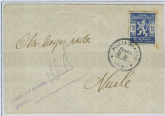
Cover with a 10H Scout stamp tied with the cds Scout handstamp (Nov. 19, 1918) and delivered to Nusle district by Scout Nusl. The Scout delivery handstamp is shown too