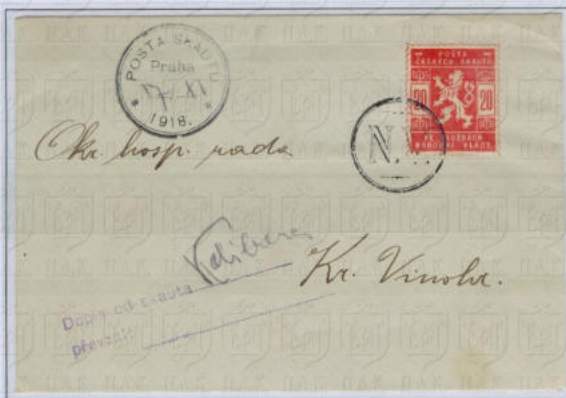
Cover with a 20H Scout stamp tied with N.V. Scout handstamp and delivered (Nov. 17, 1918) to the Vinohrady district by Scout Kalibera. The Scout cds and delivery handstamps are shown too