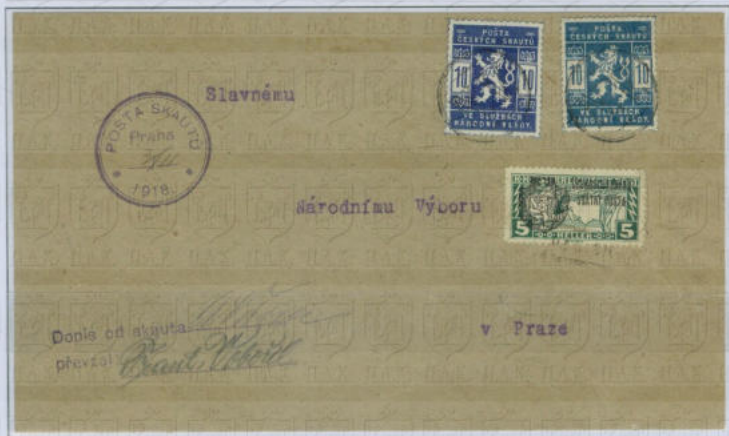
Cover tied with a 5H overprinted (2 nd Prague overprint) Austrian stamp and delivered to the National Committee by Scout Vavra (Nov. 3, 1918), bearing two additional 10H Scout stamps tied with the N.V. and franked with both the cds and the delivery Scout handstamps