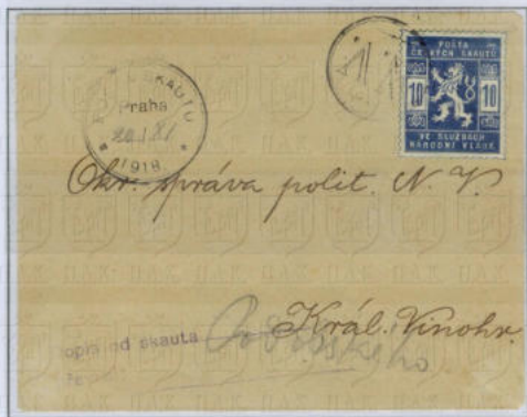
Cover with a 10H Scout stamp tied with N.V. Scout handstamp and delivered (Nov. 20, 1918) to the Vinohrady district by Scout Rodofky. The Scout cds and delivery handstamps are shown too