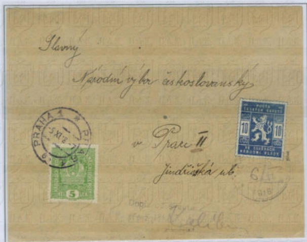
Cover with a 5H and a 15H (on reverse) Austrian stamps tied with PRAHA 1 (6p) postmarks (Nov. 5, 1918) and delivered to the National Committee by Scout Kalibera the following day, bearing an additional 10H Scout stamp tied with the Scout cds and delivery handstamp