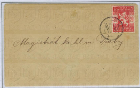
Cover with a 20H Scout stamp tied with N.V. Scout handstamp