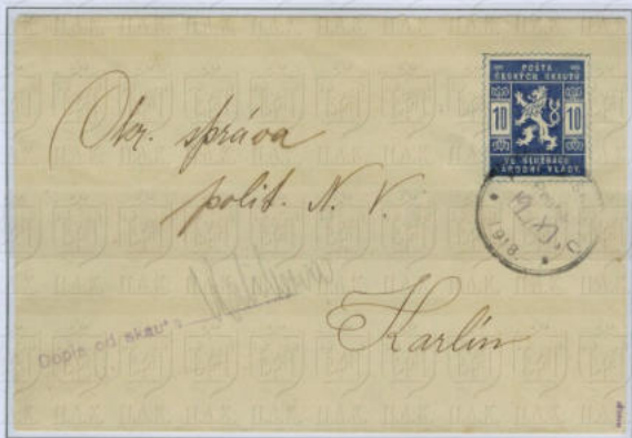
Cover with a 10H Scout stamp tied with the cds Scout handstamp (Nov. 19, 1918) and delivered to Karlín district by Scout Kalibera. The Scout delivery handstamp is shown too