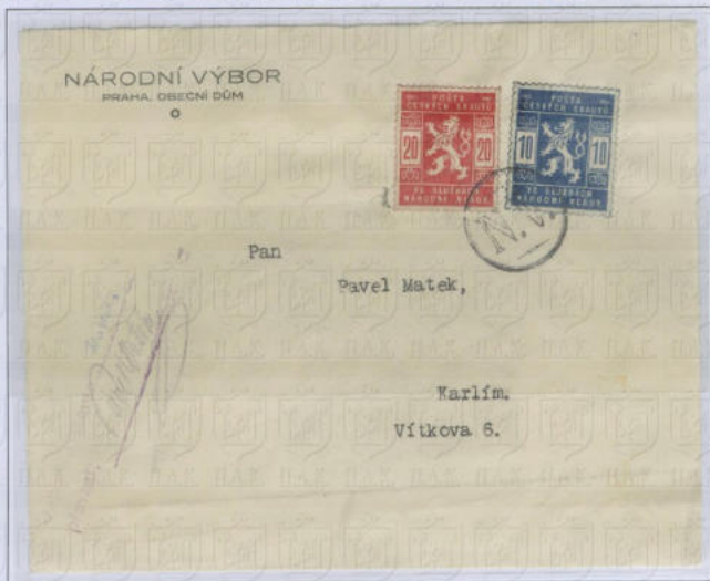
Cover of the National Committee directed to Karlín bearing both stamps of the Scout Service franked "N.V." and delivery mark with messenger and recipient signatures, but without the cds.