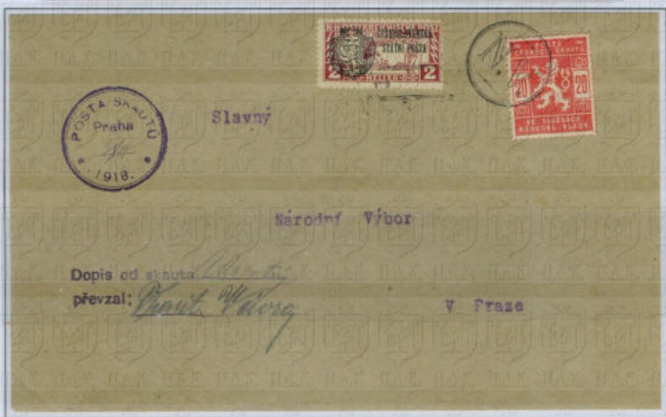
Two covers tied with a 20H (top) and a 2H overprinted (2 nd Prague overprint, bottom) Austrian stamps and delivered to the National Committee by Scouts Stretti (sent from POTŠTYN, addressed to Rössler) the first and by Novotný the second, bearing an additional 20H Scout stamp each tied with the N.V. and franked with the delivery Scout handstamps. The latter with a cds (Nov. 3, 1918) as well