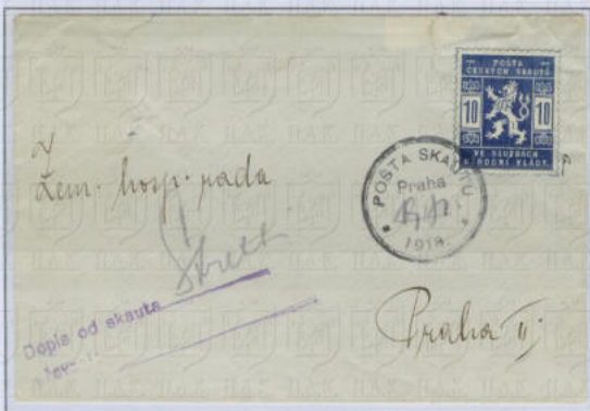
Cover with a 10H Scout stamp tied with the cds Scout handstamp (Nov. 18, 1918) and delivered to Praha II district by Scout Stretz. The Scout delivery handstamp is shown too