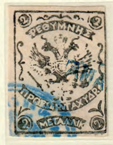
Stamp cancelled Amari (ΑΜΑΡΙ).