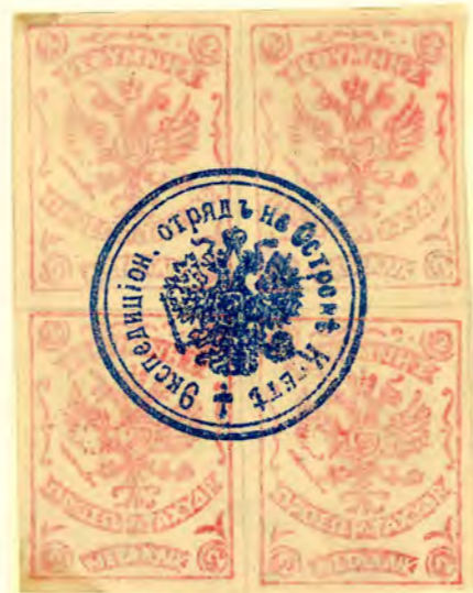
Mint block of four of the 2 metallik , pink