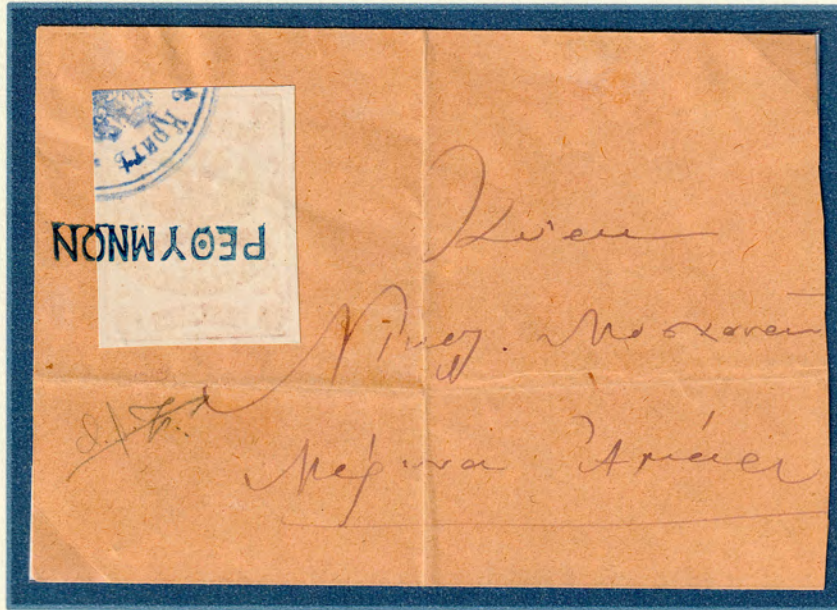
Letter from Rethymnon (PEΘYMNON) to Amari (AMAPI).

This stamp was rapidly replaced by the 2 metallik black.