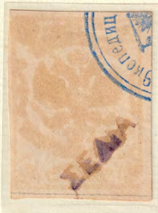
Single, cancelled Sellia (ΣΕΛΙΑ)