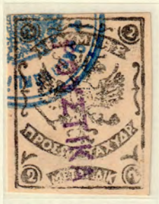
Stamp cancelled Roustika (ΡΟΥΣΤΙΚΑ).