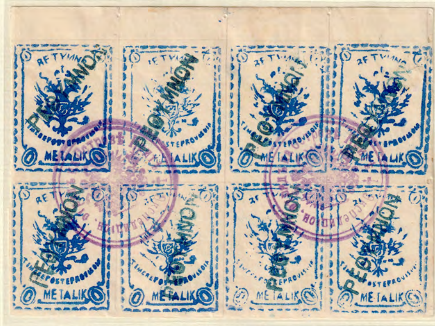
Block of eight cancelled with Rethymnon (ΡΕΘΥΜΝΟΝ)

All the stamps of this first emission have been manually & individually printed. The Russian soldier in charge of the printing, Alexandre Shokatine , drew with a pencil a set of rectangles on the blank sheet of paper before transferring the foot-print of the matrix, one after the other. These pencil lines are still visible on the multiple today. On this first value, the legend, “ provisional postage-stamp ” is written in French: “ Timbre Poste Provisoire ”. 4,800 stamps of this value have been printed and were all sold. This value was rapidly replaced by the yellow-green 1 metallik one.