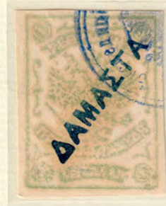
Stamp cancelled Damasta (ΔΑΜΑΣΤΑ) . Very few pieces known.