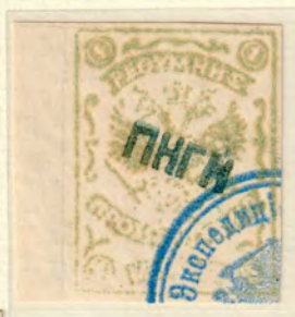
Stamp cancelled Pigi (ΠΗΓΗ) .