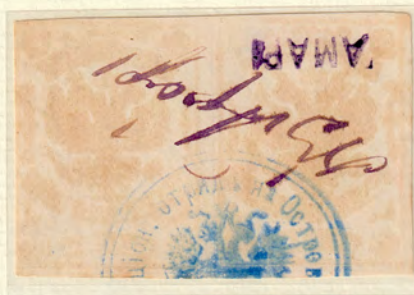
Pair, cancelled Amari (ΑΜΑΡΙ)