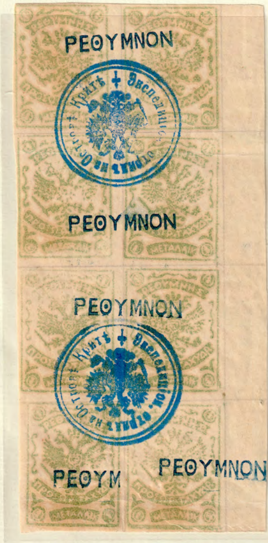
Block of height cancelled Rethymnon (PEΘYMNON).