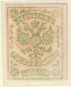
Without control postmark.