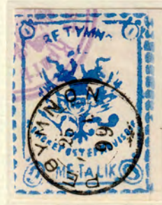
Circular postmark of Rethymnon (ΡΕΘΥΜΝΟΝ)