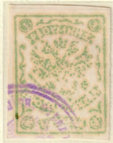
With purple control postmark.