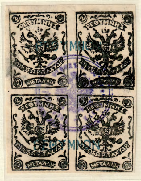
Block of four dark black, cancelled Rethymnon (PEΘYMNON).

12,965 stamps of this colour have been printed and 11,675 have been sold. The 2,290 left have been destroyed on July 1 st , 1899 according to the order of the day No. 166 of June 30 th , 1899.