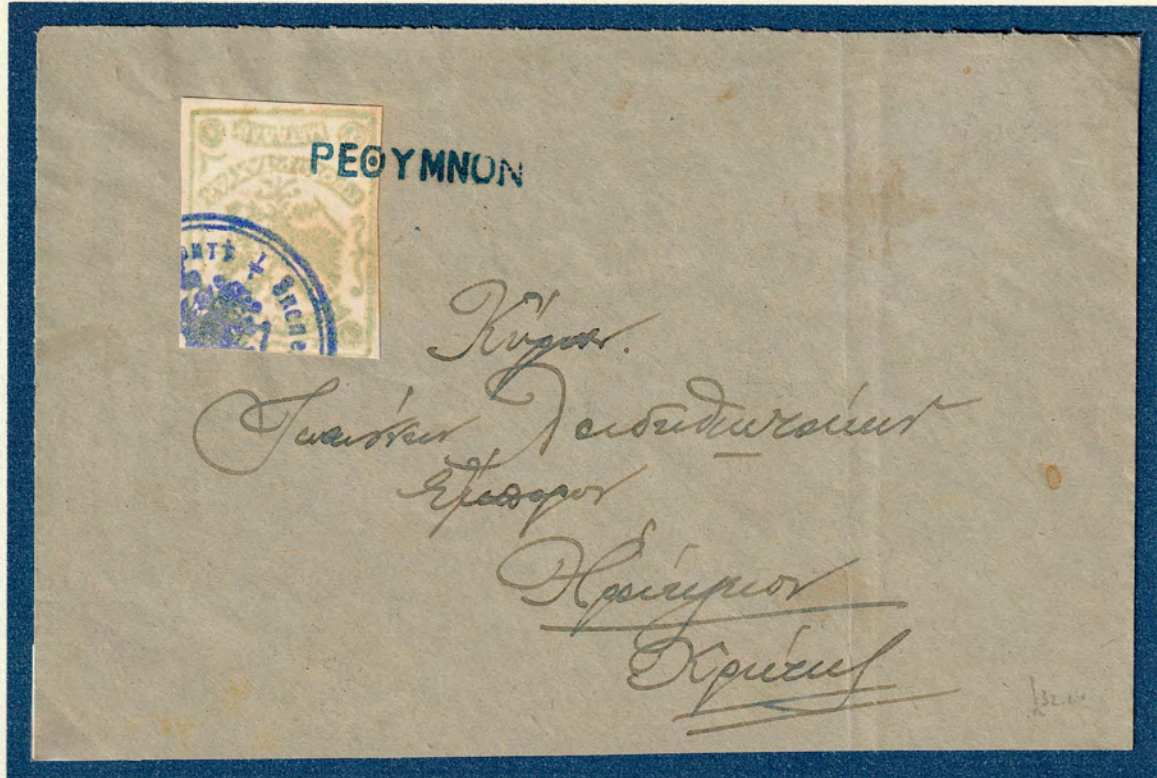
Letter from Rethymnon (PEΘYMNON) to Iraklion (HPAKLION).