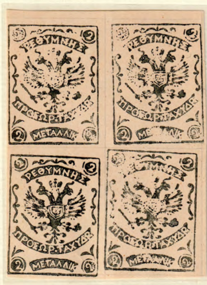
Mint block of eight.

12,965 stamps of this colour have been printed and 11,675 have been sold. The 2,290 left have been destroyed on July 1 st , 1899 according to the order of the day No. 166 of June 30 th , 1899.