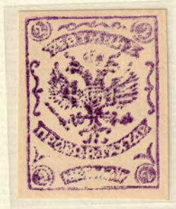
2 metallik w/o control postmark.