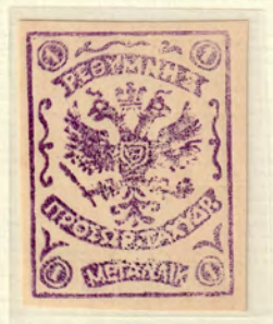
1 metallik w/o control postmark.

The legends are now in Greek. These two stamps are probably colour plate-proofs as none of them is mentioned in the very detailed & perfectly held orders of the day of the Russian Governor of the Rethymnon province, the colonel Theodore von Chiostak . They are not known on cover. The philatelic papers of the beginning of the 20 th century have reported that the Russian soldier in charge of the printing, Alexandre Shokatine , could have, either out of boredom or out of philatelic interest, printed these vignettes from the original matrices... The two purple values are on "quadrillé" paper. Less than ten items of each of these four values are known up to date.