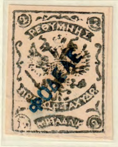
Stamp cancelled Fodele (ΦΟΔΕΛΕ). Unique item.

12,965 stamps of this colour have been printed and 11,675 have been sold. The 2,290 left have been destroyed on July 1 st , 1899 according to the order of the day No. 166 of June 30 th , 1899. Fourteen linear postmarks were used during this period: one for the town Rethymnon (very common) & thirteen for villages of the province which are rare to extremely rare for some of them.