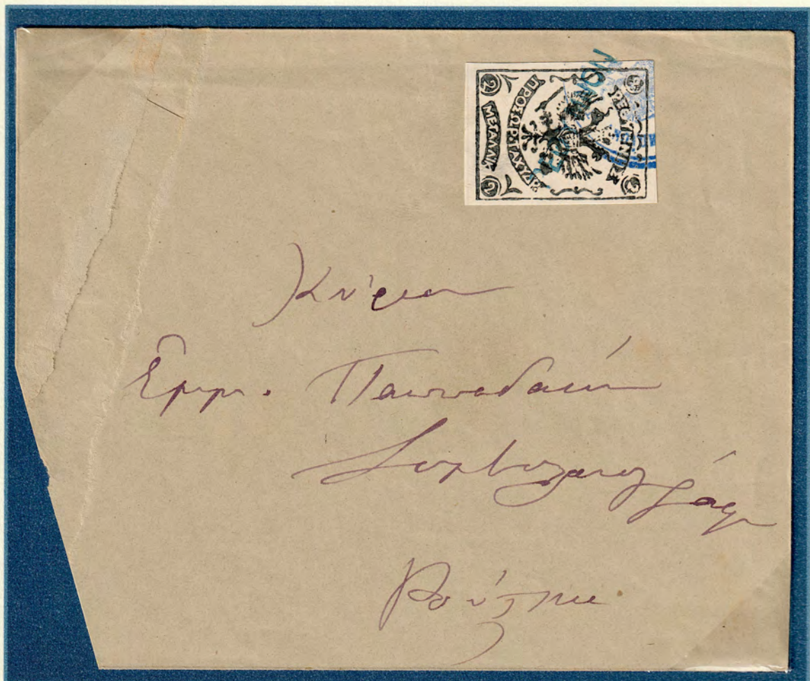
Letter from Rethymnon (ΡΕΘΥΜΝΟΝ) to Roustika (ΡΟΥΣΤΙΚΑ).