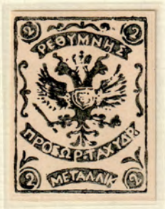
Stamp w/o control postmark, neatly printed.