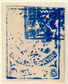
1 metallik w/o control postmark, double impression.