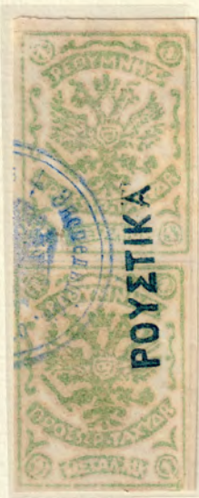
Pair cancelled Roustika (ΡΟΥΣΤΙΚΑ) .