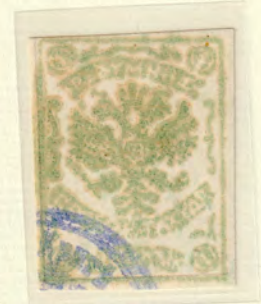
With blue control postmark.