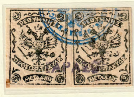
Pair cancelled Garazo (ΓΑΡΑΖΟ).