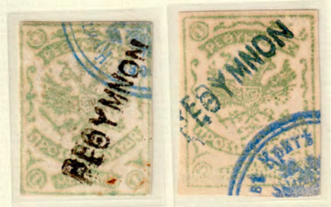
Double impression of the linear postmark of Rethymnon (PEΘYMNON).