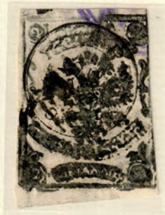
Single cancelled with circular postmark of Rethymnon (PEΘYMNON).