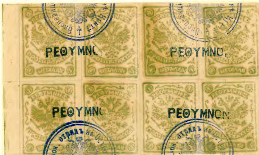
Marginal block of height of the 1 metallik , yellow-green, with the linear postmark "PEΘYMNON" ( Rethymnon )