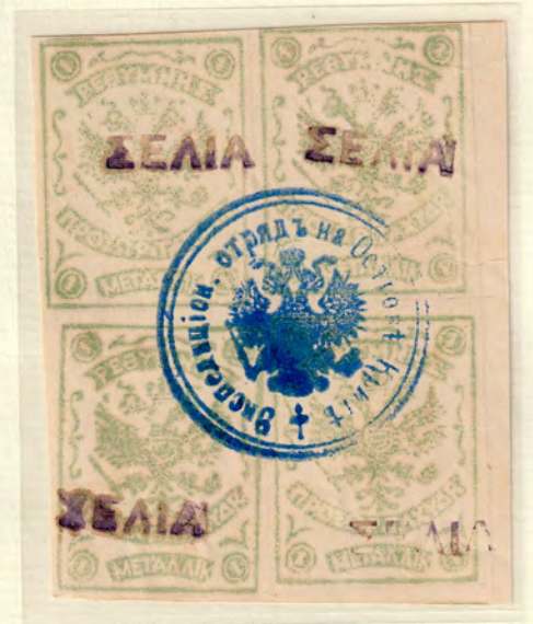
Block of four cancelled Sellia (ΣΕΛΙΑ) . Only very few items known.