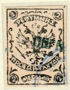
Stamp cancelled Pigi (ΠΗΓΗ).