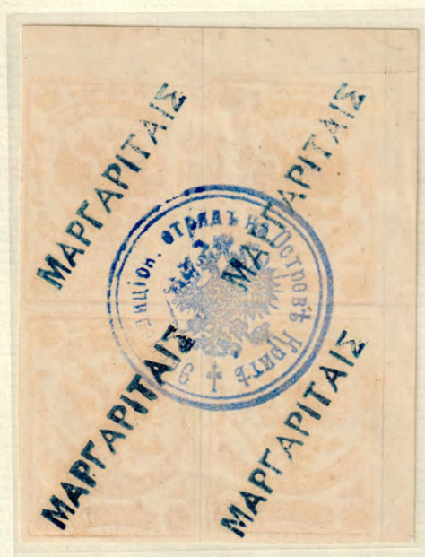
Block of four, cancelled Margarites (MAPΓAPITAIΣ).

The largest multiple blocks known with these cancelations.