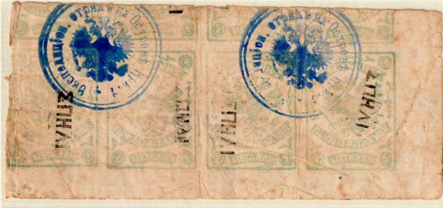
Strip of four cancelled Spili (ΣΠΙΛΙ) . The largest multiple known with this postmark.

Fourteen linear postmarks were used during this period: one for the town Rethymnon (very common) & thirteen for villages of the province which are rare to extremely rare for some of them.