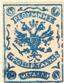
1 metallik w/o control postmark, printed recto-verso. Photo of the recto on the left.