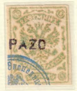
Stamp cancelled Garazo (ΓΑΡΑΖΟ) .