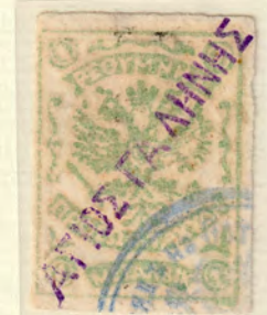
Stamp cancelled Aghia Galini (ΑΓΙΟΣ ΓΑΛΗΝΗΣ) .