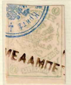
Stamp cancelled Melambes (ΜΕΛΑΜΠΕΣ) .