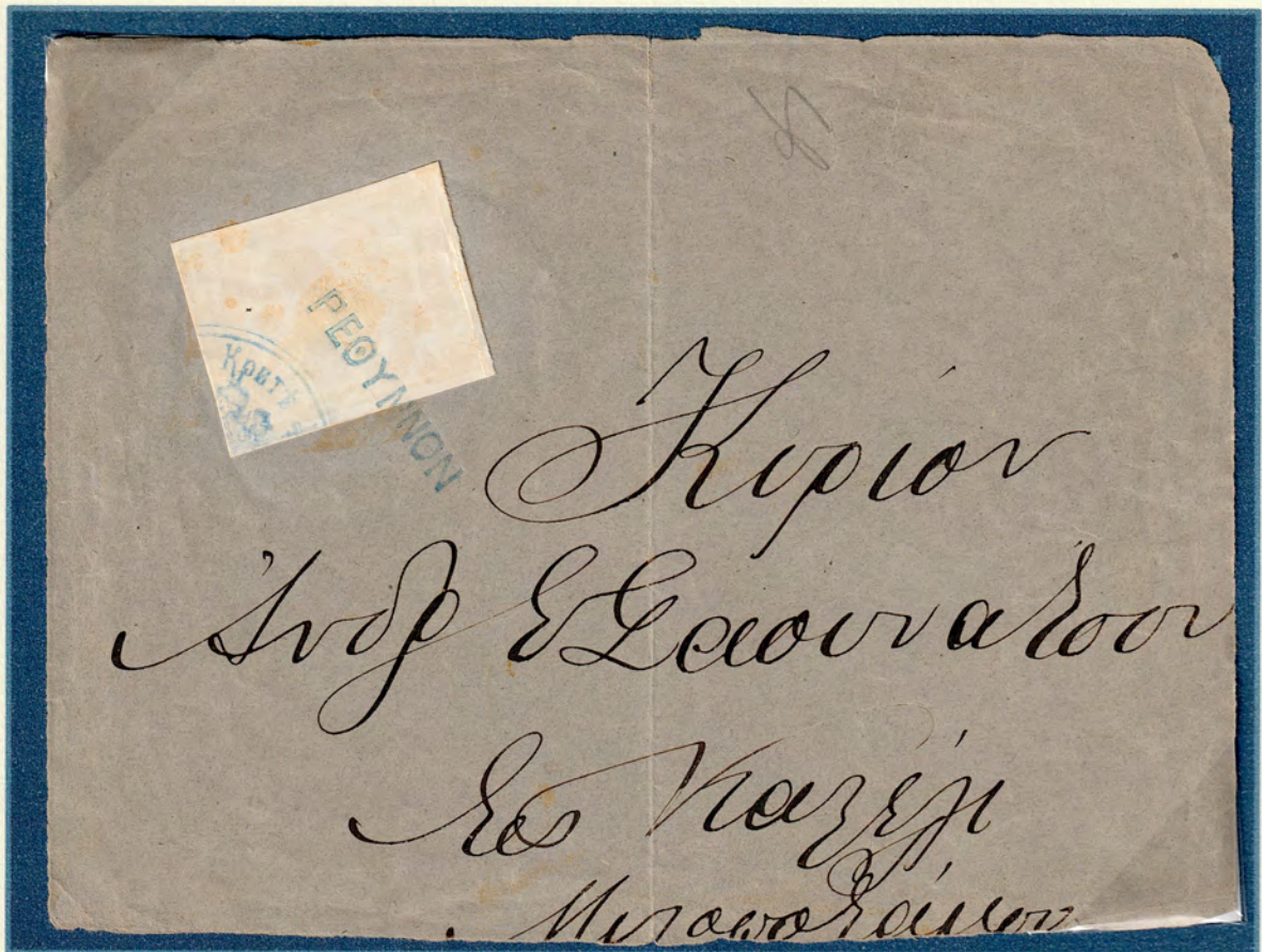
Letter from Rethymnon (PEΘYMNON) to Kastelli (KΑΣTEΛI).