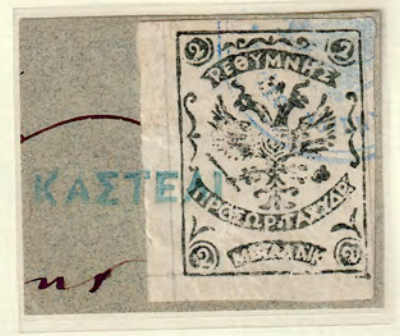
Stamp cancelled Kastelli (ΚΑΣΤΕΛΙ).