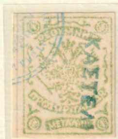
Stamp cancelled Kastelli (ΚΑΣΤΕΛΙ) .