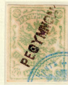
Black linear postmark of Rethymnon (PEΘYMNON).