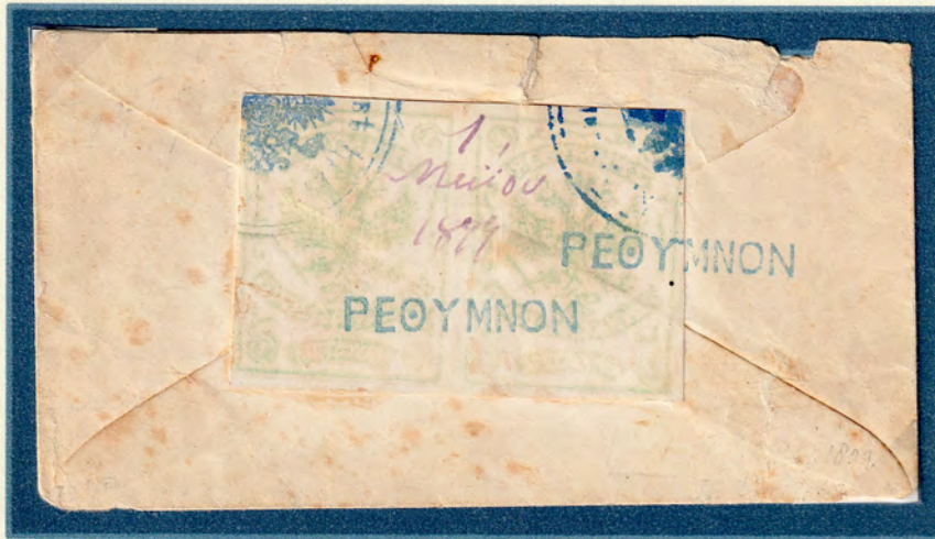
Letter from Rethymnon (PEΘYMNON) to PERIVOLIA (ΠEPIBOLIA), close to Chania.