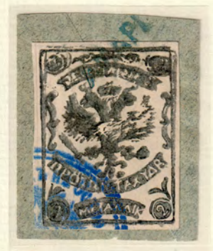
Single cancelled Amari (AMAPI).