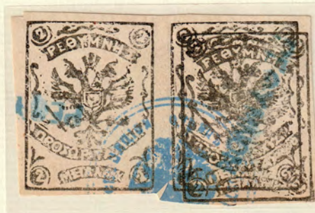
Pair cancelled Rethymnon (PEΘYMNON). Double impression on the right stamp.