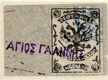
Stamp cancelled Aghia Galini (ΑΓΙΟΣ ΓΑΛΗΝΗΣ).