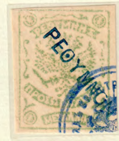
Blue linear postmark of Rethymnon (PEΘYMNON).