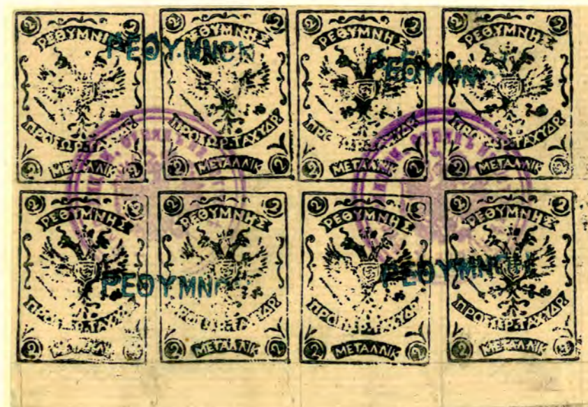
Corner block of height of the black 2 metallik , with purple control postmark and linear postmark of "PEΘYMNON" ( Rethymnon )