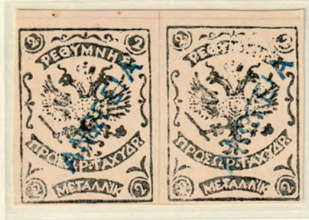
Pair cancelled Anogia (ΑΝΩΓΙΑ). Unique item.