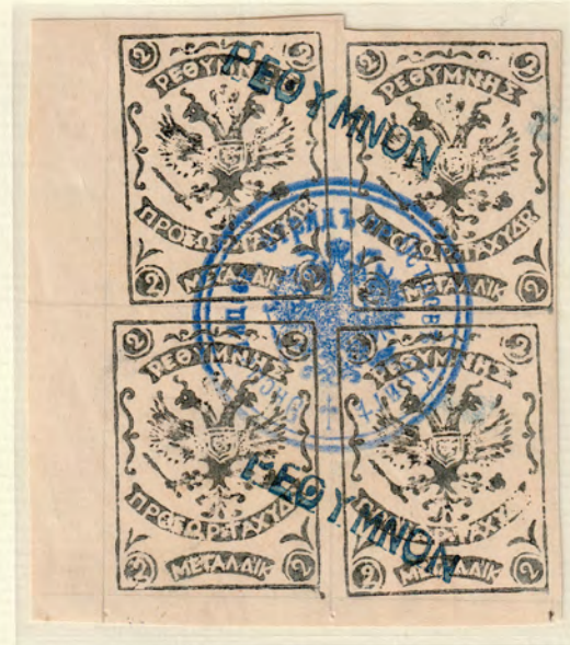
Block of four greyish, cancelled Rethymnon (PEΘYMNON).