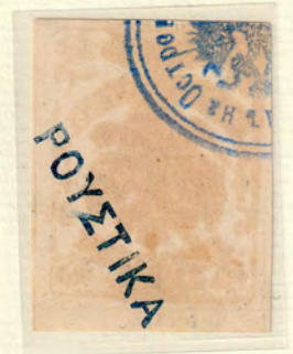
Single, cancelled Roustika (ΡΟΥΣΤΙΚΑ)