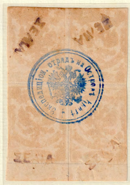
Block of four, cancelled Sellia (ΣEΛIA).