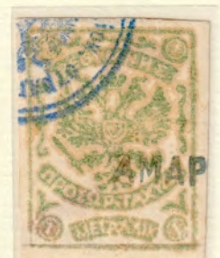
Stamp cancelled Amari (ΑΜΑΡΙ) .