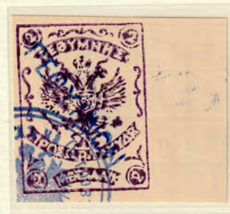
2 metallik with control postmark, and cancelled Rethymnon (ΠΕΘΥΜΝΟΝ).