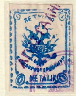
AgiaGalini (ΑΓΙΟΣ ΓΑΛΗΝΗΣ)