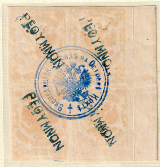
Block of four, cancelled Rethymnon (PEΘYMNON)

This stamp was rapidly replaced by the 2 metallik black.