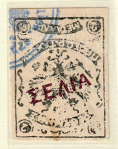
Stamp cancelled Sellia (ΣΕΛΙΑ).