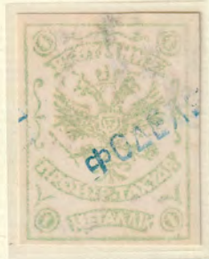
Stamp cancelled Fodele (ΦΟΔΕΛΕ) . Unique item.