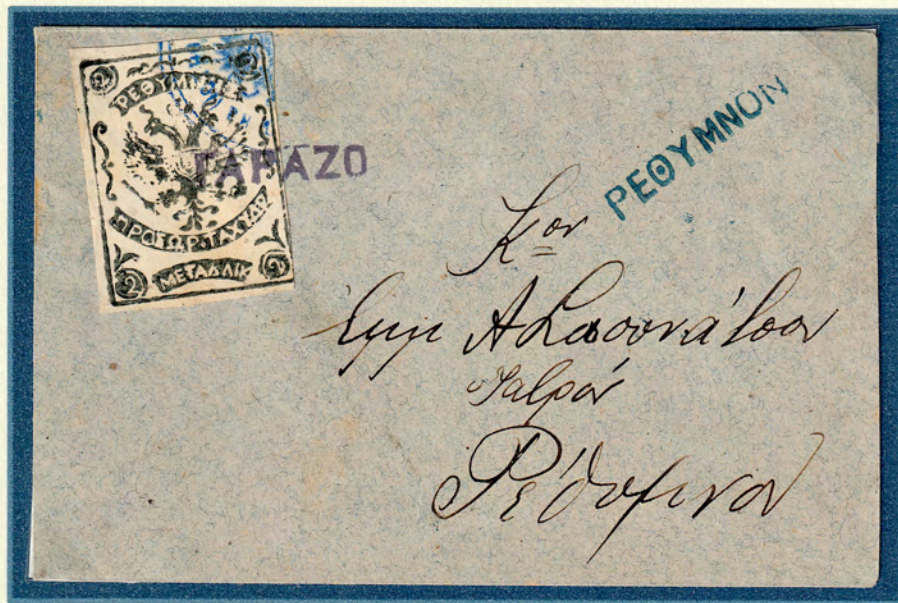
Letter from Garazo (ΓΑΡΑΖΟ) to Rethymnon (ΡΕΘΥΜΝΟΝ).

12,965 stamps of this colour have been printed and 11,675 have been sold. The 2,290 left have been destroyed on July 1 st , 1899 according to the order of the day No. 166 of June 30 th , 1899.