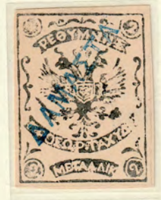
Stamp cancelled Damasta (ΔΑΜΑΣΤΑ). Only very few items known.