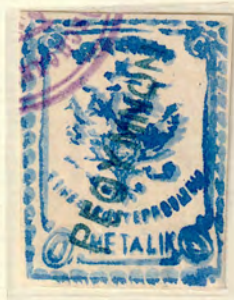
Double impression, cancelled Rethymnon (ΡΕΘΥΜΝΟΝ)