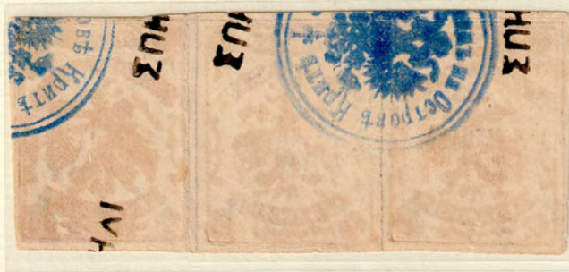
Strip of three, cancelled Spili (ΣΠΙΛΙ).

This stamp was rapidly replaced by the 2 metallik black.