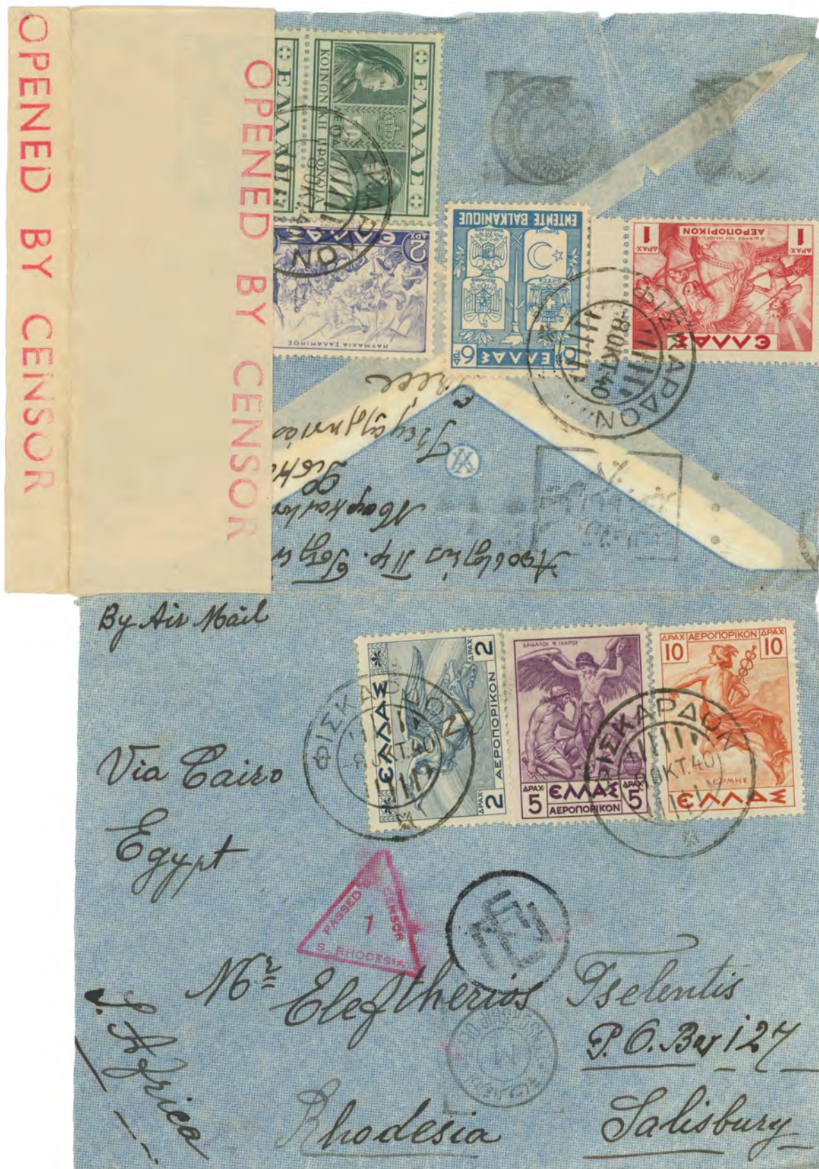
6δρχ Entente Balkanique + 2δρχ Historical issue & 2x50λ Charity (Queens), together with 1δρχ+2δρχ+5δρχ+10δρχ airmails (Mythological) tied on airmail cover with ΦΙΣΚΑΡΔΟΝ 8.ΟΚΤ.40 (Fiscardo, Cefalonia) sent to Salisbury, Rhodesia. Examined by the Hellenic Exchange Control, with small circular ΠΕΝ marking. Censored in Egypt, with black marking CENSORSHIP DEPT. and upon arrival in Rhodesia, with red triangular PASSED BY CENSOR S. RHODESIA 1 and linear handstamp OPENED BY CENSOR on blank censored tape. First weight rate to abroad (8δρχ) + airmail (18δρχ).