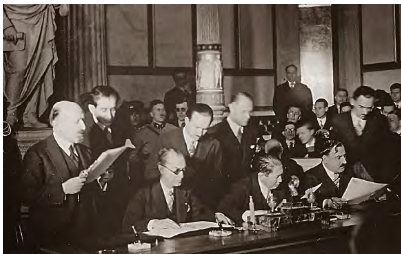
Balkan Pact of 1934

Ultimately, all the efforts of the Conferences were partially utilized by only four Balkan states with the signing of a Balkan Pact on February 8, 1934 in Athens. The Balkan Pact mainly concerned the effort of the states that favored the maintenance of the existing territorial arrangement (Greece, Turkey, Romania, Yugoslavia), excluding Bulgaria, but also Albania, which had clearly joined Italy's sphere of influence.