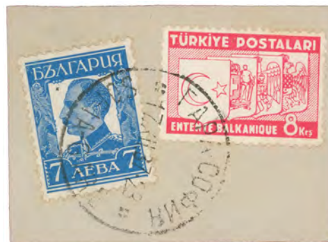
The 8 Krş Turkish stamp in combination with a 7 Лева Bul- garian, tied on fragment with ΓΑΡΑ ΣΟΦΙΑ - SOFIA GARE 17.XII.37