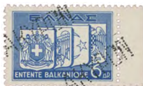
Forged dotted overprint AKYPON (=not valid)