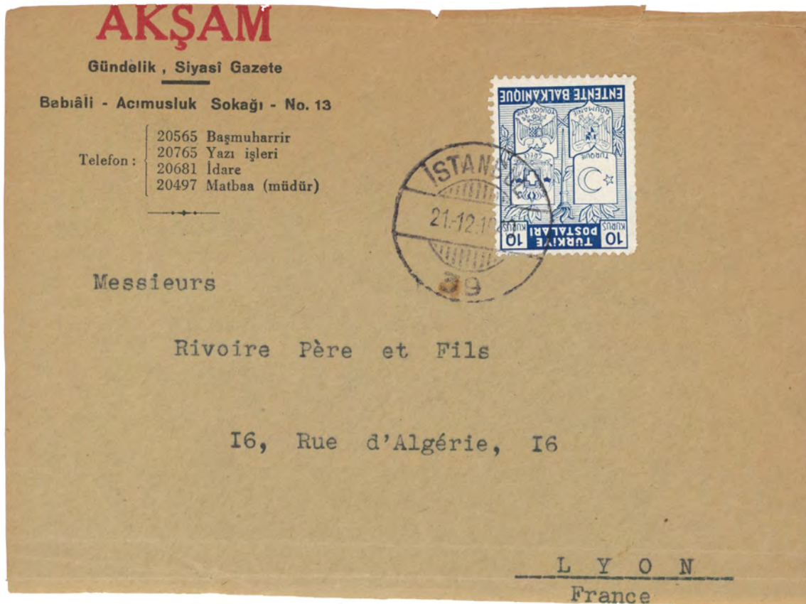
10 krş Entente Balkanique issue single franking, tied on corner cover sent to Lyon France with ISTANBUL 39 21.12.1940 . First weight rate to abroad (10 krş).