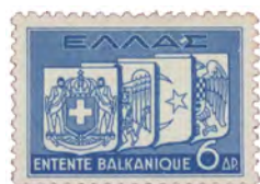
White patch behind Σ of ΕΛΛΑΣ