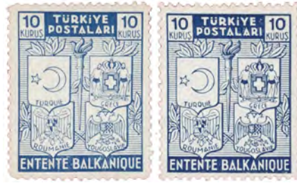
Two shades of the 10 krş value