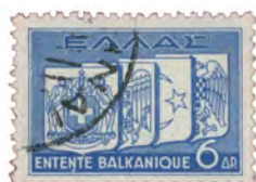
White dash on Σ of ΕΛΛΑΣ