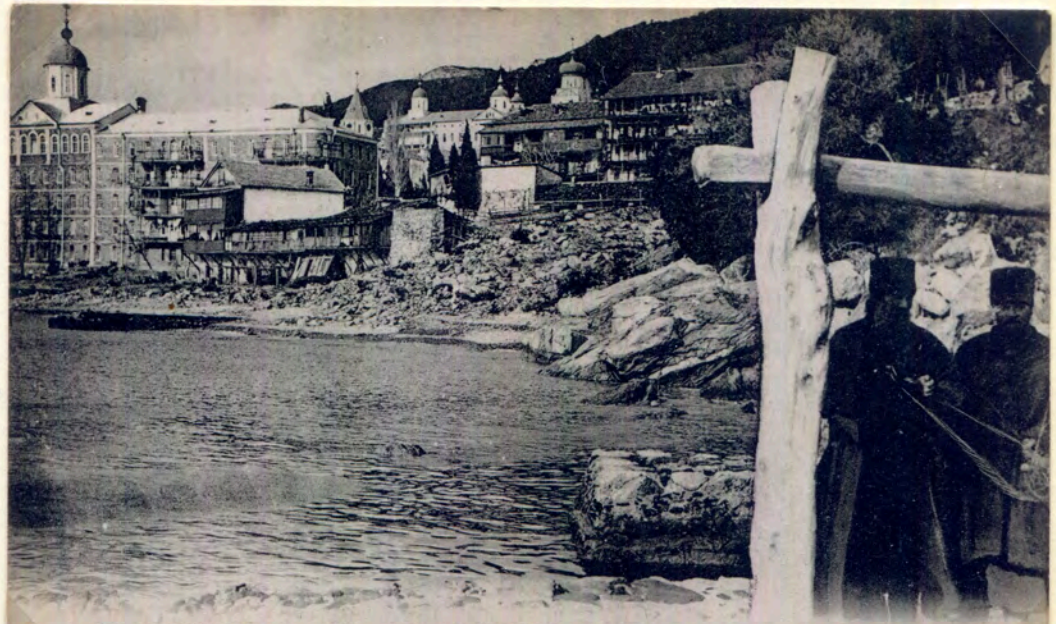
Card Postale. Mount Athos. St.Panteleimon Monastery, c. 1890-1900 Unknown editor