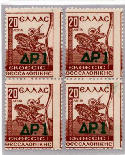
Vertical displaced perforation