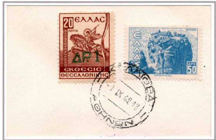
Cover with the special 1 Dr/20 Lepta stamp for the TIF with First Day of Issue