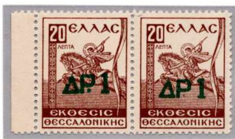
Without dot after «ΔΡ»