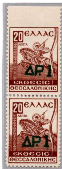
Pair without horizontal upper perforation