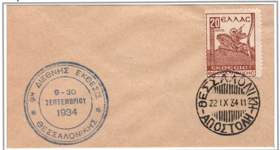
Cover with the special 20-cent stamp for the TIF with First Day of Issue cancellations and a commemorative stamp of the 9th TIF.

Postal items coming from the Post Offices of Thessaloniki, which did not bear, in addition to the regular postal rates, the additional 20-lepta special charge for the TIF, were considered insufficiently prepaid and the recipient was obliged to pay twice the missing additional charge, which was collected by means of postage due stamps.