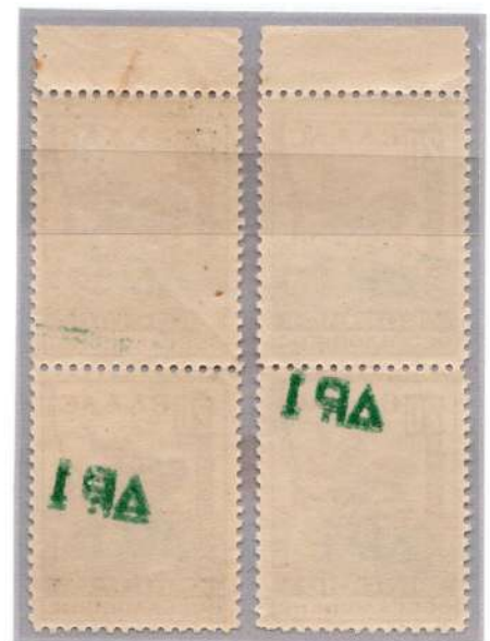
Pair with one stamp Decalque