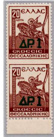
Pair with displaced perforation in the middle