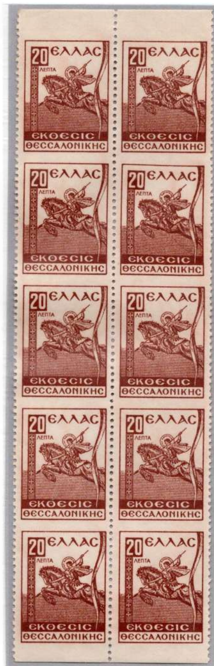
Vertical strip of 10 stamps without perforation horizontally

Strip of 10 stamps from the bottom of sheet with double perforation