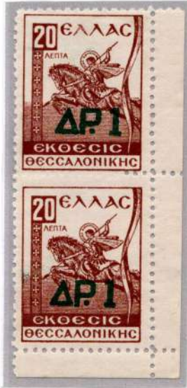
Pair with imperfect perforation in the middle