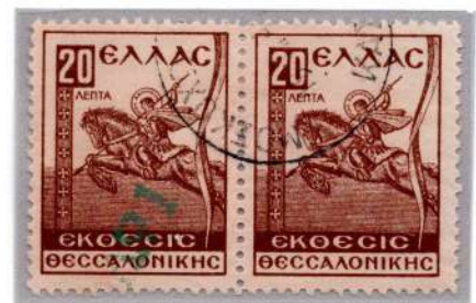
Diagonal surcharge only at first stamp