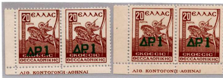
«Kontogoni» Lithographic Printing House, Athens White and yellowish paper