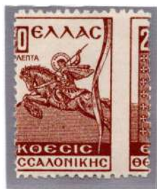
Displaced perforation vertically