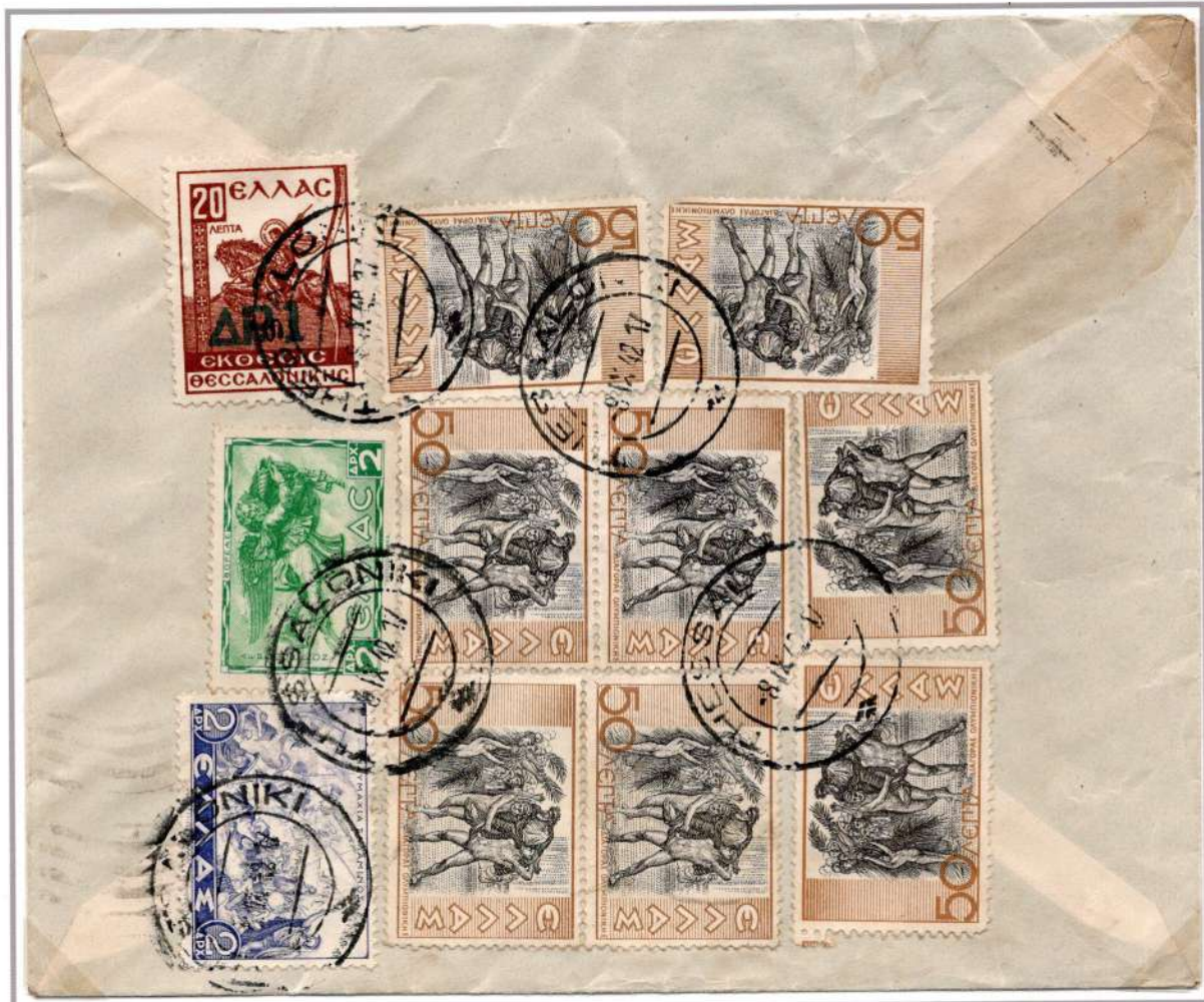
Airmail cover with 23 Drs postage stamp, 2 Drs airmail stamps & 1 Dr for TIF Fund posted from ΘΕΣΣΑΛΟΝΙΚΗ 8.9.1942 to ΑΘΗΝΑΙ . Postal Rates 28 Drs: 25 Drs for 1 st weight letter (up to 20 gr), 2 Drs for airmail & 1 Dr for TIF