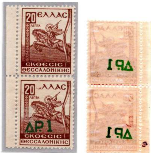
Pair, one without surcharge Decalque