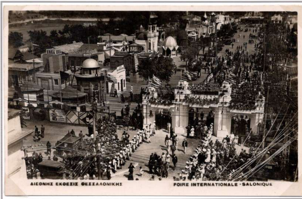
The opening of the 9th Thessaloniki International Fair, 9 September 1934

The first exhibition was held from 3-17 October 1926. The original premises were located in the southern part of the Areos Field and covered an area of 37 acres. It remained there until it was moved to a new site in 1940, where it is still located today. The years passed and we arrived at the 9th exhibition, which took place from 9-30 September 1934. Then something of philatelic interest took place.