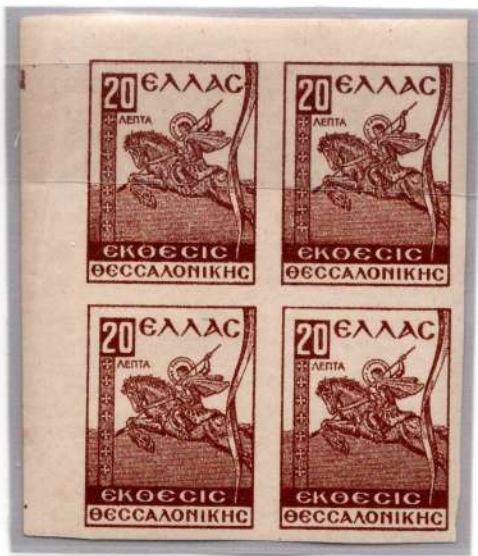
Block without perforation