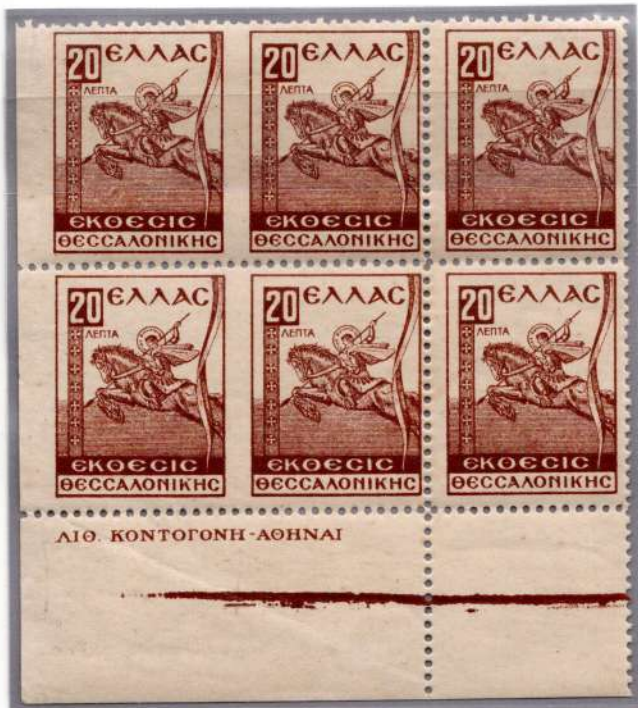
Blocks without vertical perforation on the left and center