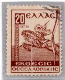
Printed on folded paper

«Kontogoni» Lithographic Printing House, Athens