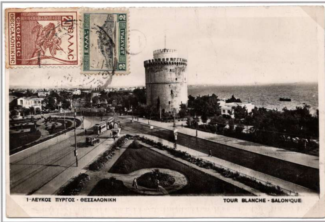
Picture postcard "Thessaloniki, White Tower" with 2 Drs postage stamps & 20 Lepta TIF Fund, posted from ΘΕΣΣΑΛΟΝΙΚΗ ΑΠΟΣΤΟΛΗ 15.9.1935 to Piraeus . Postal Rates 2.20 Drs: 2 Drs for postcard & 20 L for TIF .