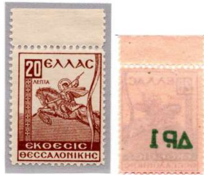
Without surcharge on face