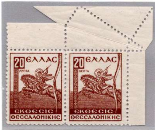
Perforation variety due to paper fold