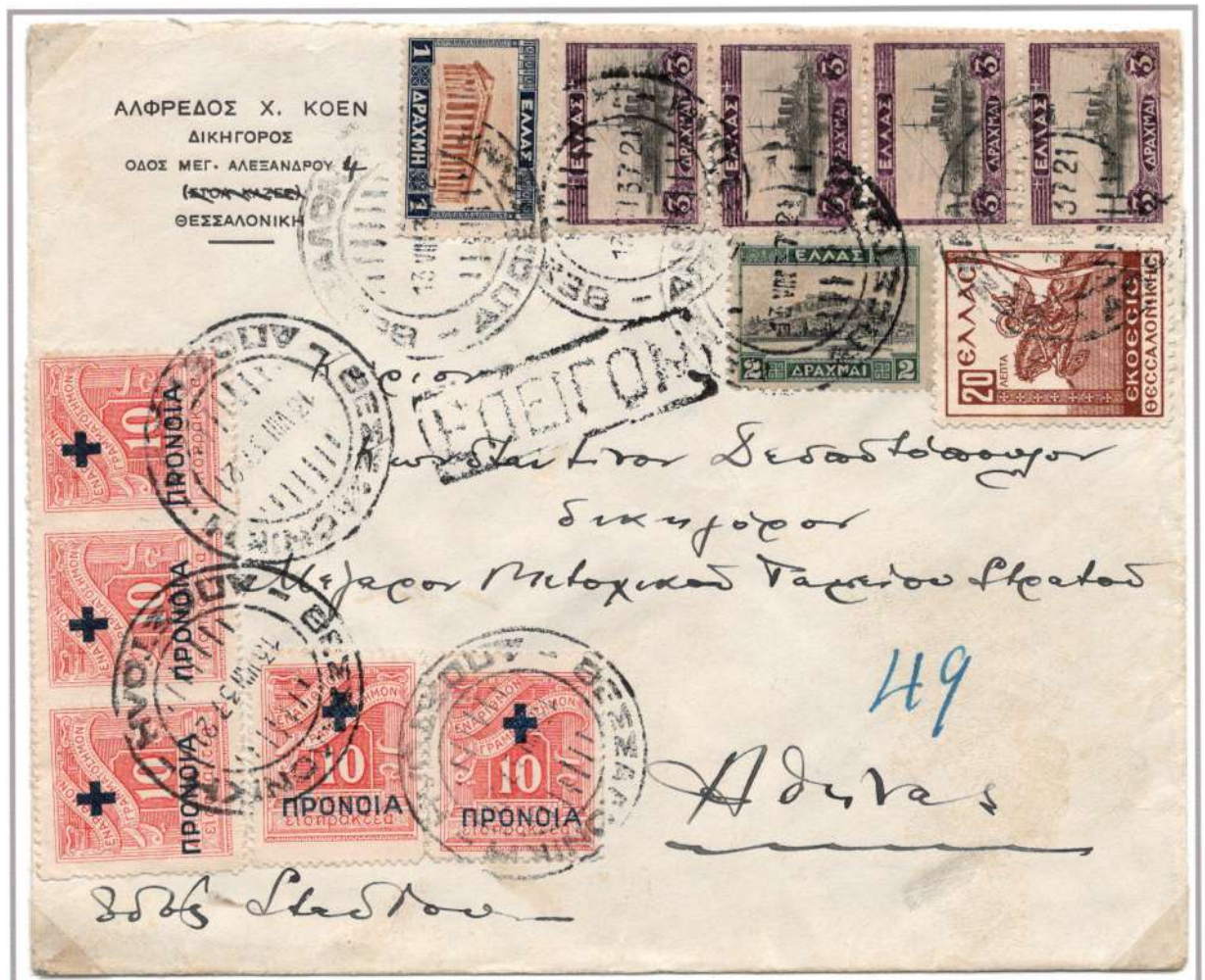
Express cover with 15 Drs postage stamps, 50 L for Social Welfare Fund & 20L for TIF Fund, posted from ΘΕΣΣΑΛΟΝΙΚΗ ΑΠΟΣΤΟΛΗ 13.8.1937 to ΑΘΗΝΑΙ ΑΦΙΞΙΣ 14.8.37 . Postal Rates 15.70 Drs: 5 Drs for 2 nd weight letter (21-40 gr), 10 Drs for express, 50 L for Social Welfare Fund & 20 L for TIF .